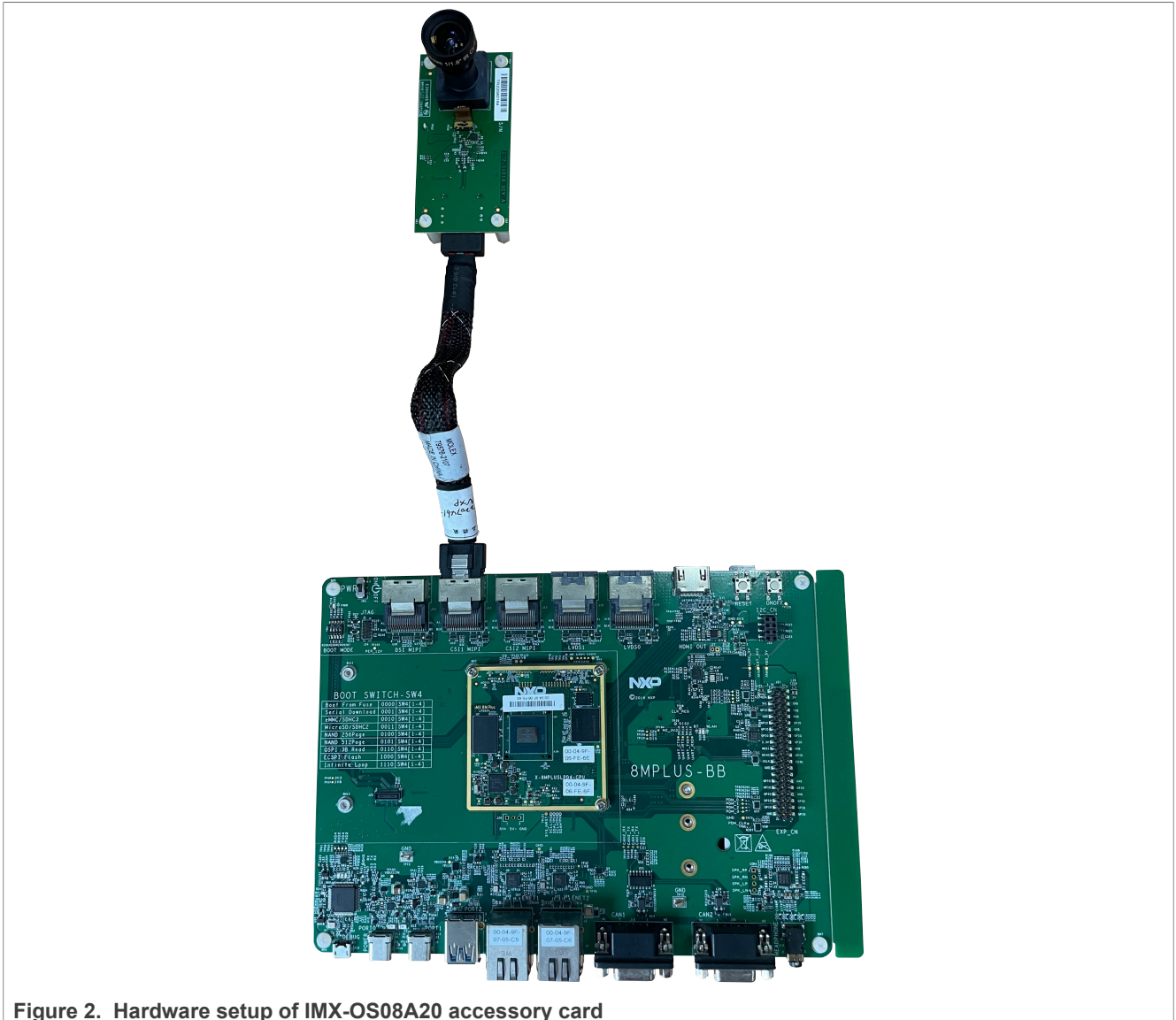
Figure 2. Hardware setup of IMX-OS08A20 accessory card