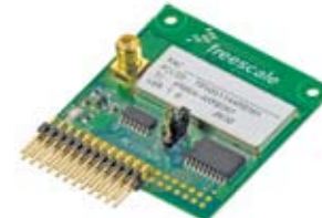
802.15.4 RF Transceiver